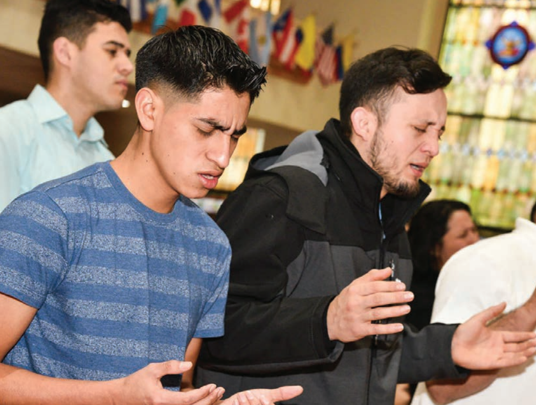
Congregation in worship during a midnight service | Congregación en adoración durante un servicio de la medianoche

¿habrá algún lugar para sentarse?" Pero también dijimos: "No, nos mudaremos porque necesitamos expandirnos. Si Dios va a hacer crecer nuestra congregación, no podemos quedarnos donde estamos". Así que continuamos a orar.