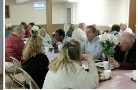
Above: Congregation enjoying Fellowship Meal Left: Kids & Adults enjoying VBS