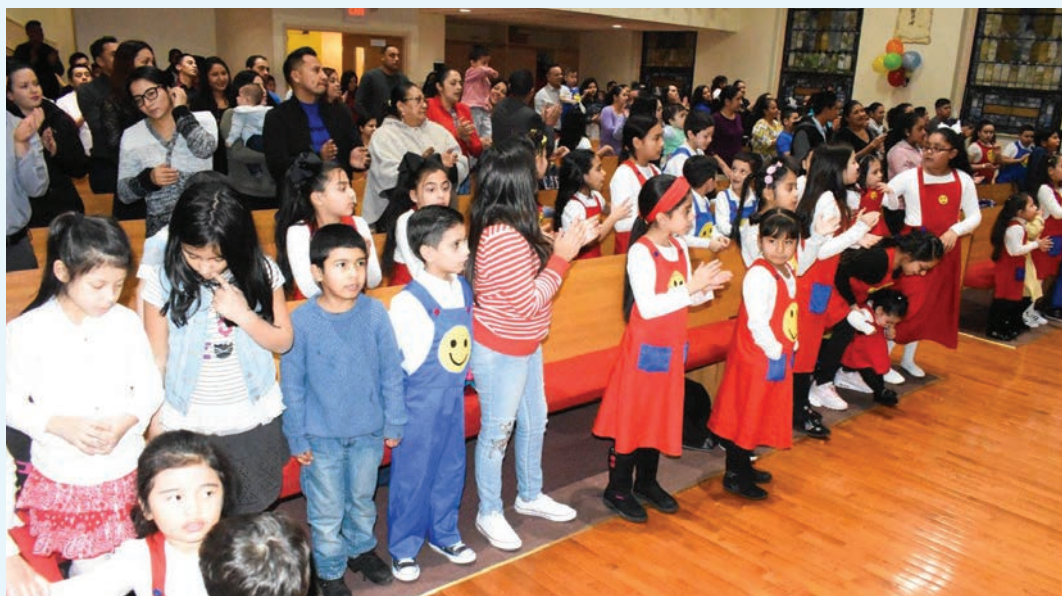
Children in worship during their Children's Special Service | Niños en adoración durante el servicio especial de Niños

We have services everyday of the week except Saturday. We do not stop. There are about 85 youth, who have their own service on Friday evenings. The 130 children between the ages of 5 and 12, have their own service on the last Thursday of every month. They lead the entire service, including seating one another, singing, and preaching.