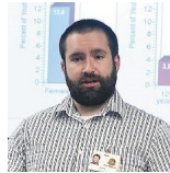
Billy Brick Mental Health First Aid Training