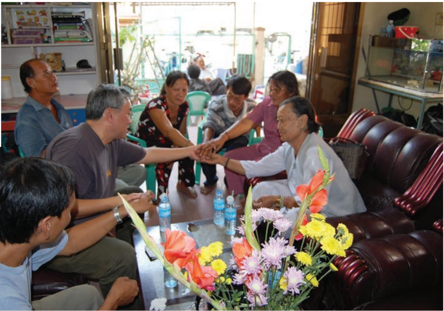
Above and Right: Ministry in Vietnam. Left: Prayer and Worship in a house church.