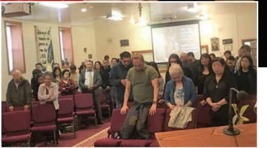
Vietnamese Mennonite Church worship service.