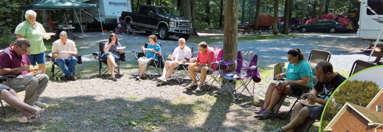
Left: Church retreat at Camp Swatara