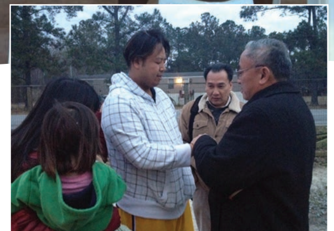
Ministry in North Carolina.

God has placed not one, but many different people like Paul and Apollos into my life.