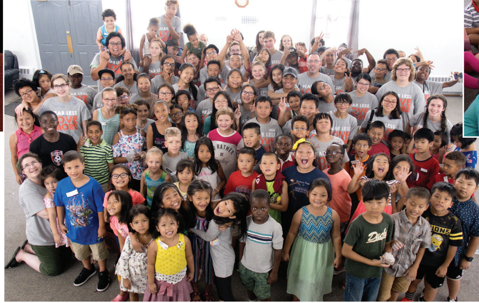
Youth leaders, students, and adult leaders gather for a group picture at the 2019 VBS.