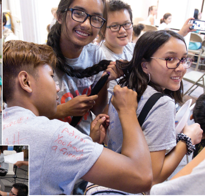
Making memories by signing t-shirts.