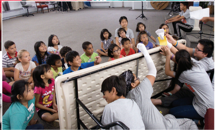
Youth leaders perform a sock-puppet show for younger students.