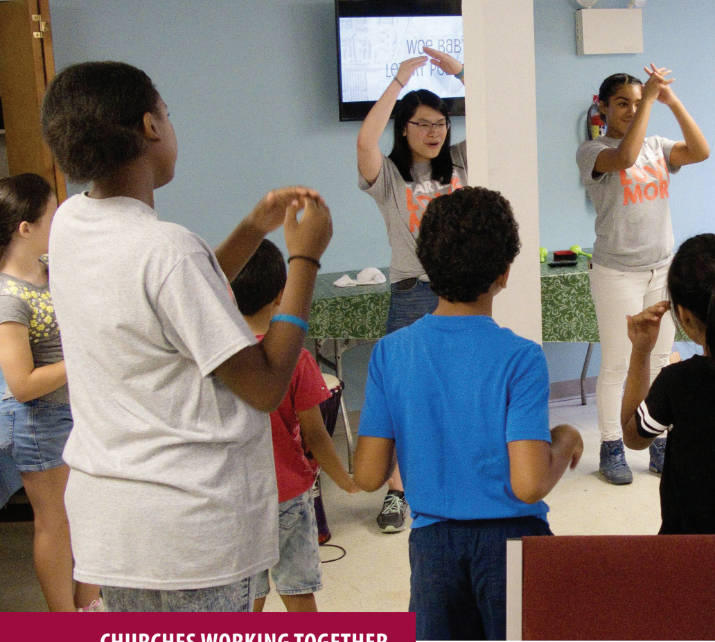
Youth leaders teach a module of the VBS curriculum at RiversEdge.