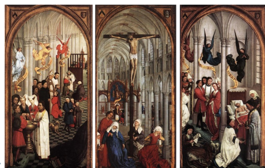
Seven Sacraments triptych, van der Weyden 1445.

Students select their level of involvement by the textbook they select to read during the two-part study, ranging from over 1000 pages to less than four hundred pages.