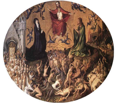
Stefan's medieval painting, The Last Judgment, 1435.

Church History for Anyone: Part 2, Reformation to Modern Church—September 29