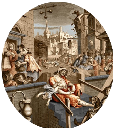
Gin Lane, Hogarth, 1751