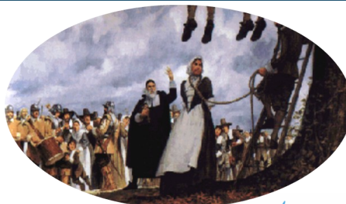
Quaker Mary Dyer led to gallows in Puritan New England. Pyle 1905.

Students are responsible to purchase their own text.