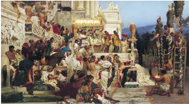
Nero's garden party illuminated by burning Christians as torches, Siemiradzki, 1876).

Registration fee goes to STEP Study Award. Google Classroom and ZOOM will deliver the course to students. An internet connection is required and a gmail address is needed for Google Classroom access. See front for registration and payment details.