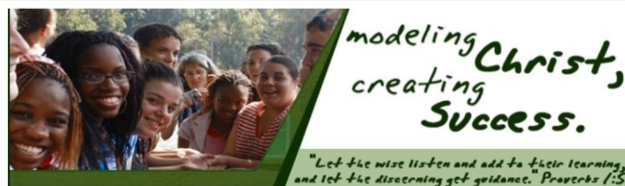
Mount Clare Christian School