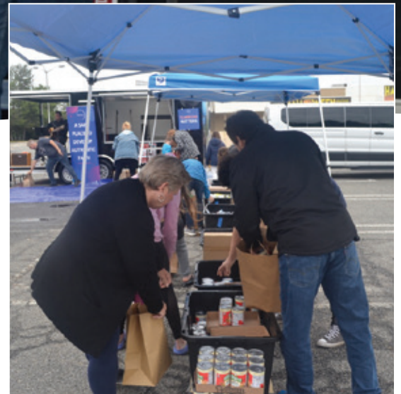
Below: People at Revive's outdoor pop-up pantry.