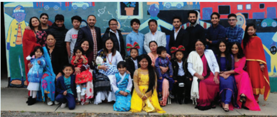
Bhutanese Nepali Church of Lancaster outside their meeting place on West End Ave.

Historically, the language was called Khas Speech, spoken by the Khas people of southern Asia and also called Gorkhali, which was the language of the Gorkha Kingdom, located in what is today western Nepal. Nepali uses the Hindi alphabet for the written form of the language.