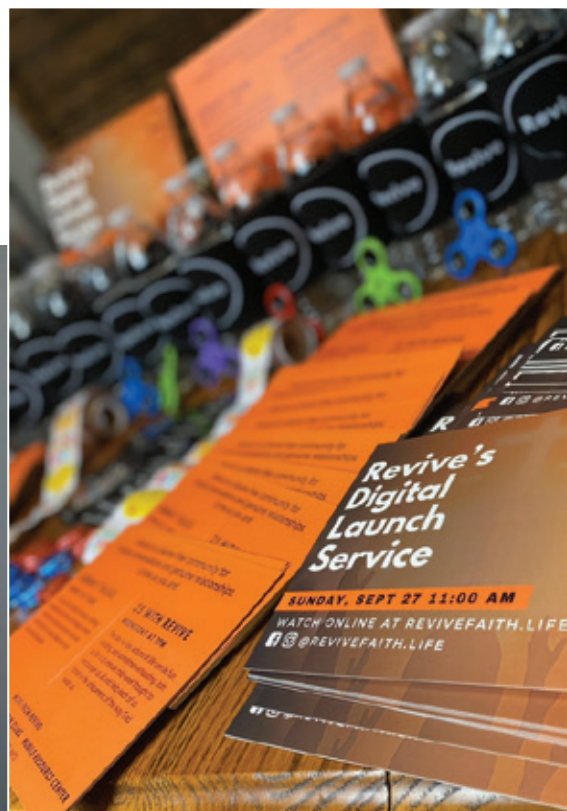
Above: Promotional materials for the launch of Revive in fall 2020.