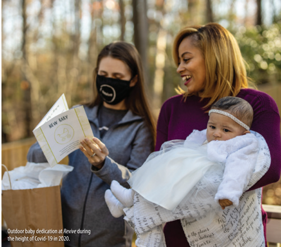
Outdoor baby dedication at Revive during the height of Covid-19 in 2020.

The days, weeks, months, and years ahead of us are exciting and unclear. We do not know what the final impact will be on the church after a pandemic. Yet, we are confident that the Holy Spirit will teach us how to live and lead differently in a future