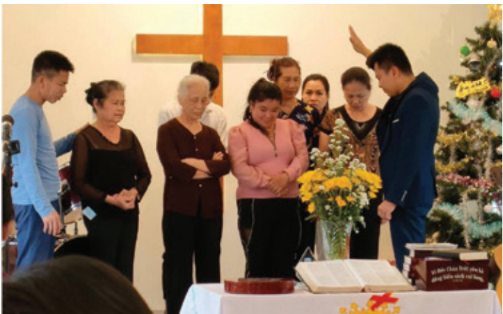
Praying for new believers in a house church in Vietnam.

Vietnamese employs six tones. A change in a tone changes the meaning of the word. For example: ca (mug), cà (eggplants), cả (all), cá (fish). The current written system of Vietnamese was developed by Catholic missionaries in the seventeenth century but was not officially used until the beginning of twentieth century. French colonial rule of Vietnam led to the official adoption of the Vietnamese alphabet based on the Latin alphabet. Sentence structures in Vietnamese language have the same "subject-verb-object" word order as used in English.