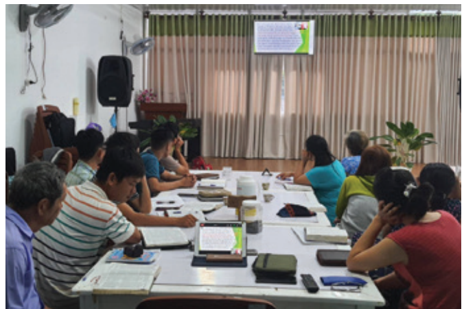
A congregation in Vietnam watches Bishop Nguyen streaming a sermon from the USA.