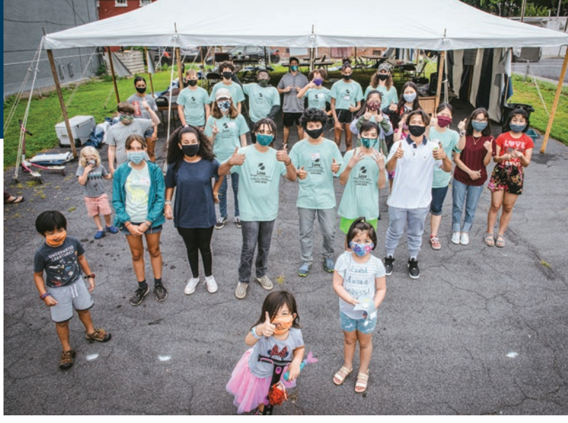
Youth Leaders prepare to receive children at VBS.

As God would have it, these two Youth Leaders ended up on the same team/station during VBS 2019. The adult VBS Youth Leader Coaches, unaware of the previous history between the two Youth Leaders, provided words of encouragement and wisdom, with the emphasis that God can do ALL things. The Youth Leader Coaches prayed over the Youth Leaders and asked God