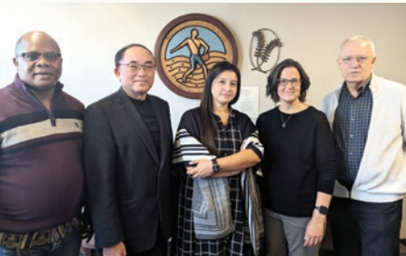
The LMC Financial Stewardship Team

We invite you and your congregation to be active partners with us in this ongoing work through the financial support of LMC in 2024. We ask that you prayerfully consider a gift. Your generous support and prayers will help us positively impact the Church's future for Kingdom purposes!