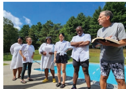
Baptism at the retreat. Below: A group from Immanuel Community Church at the Labor Day weekend retreat.