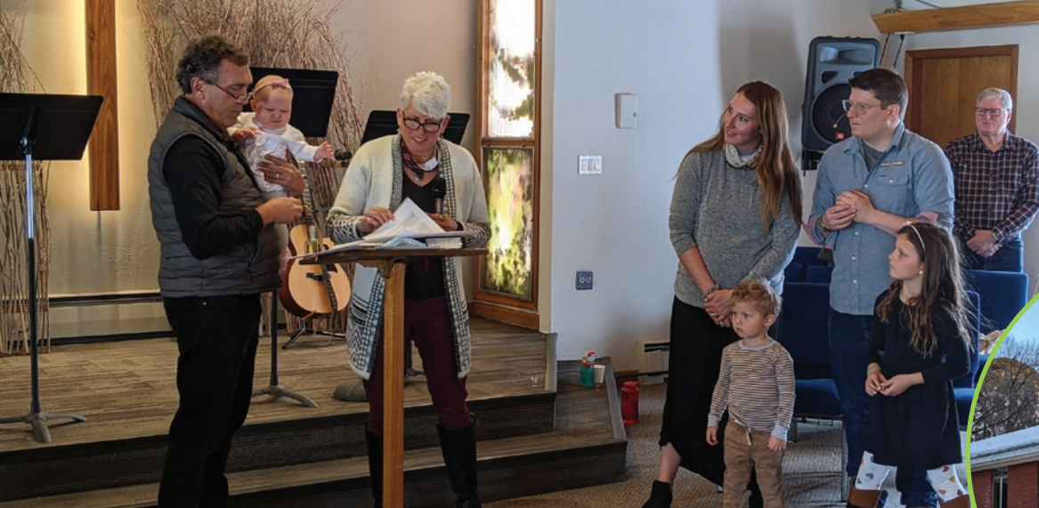
Left: Blessing of a new baby.