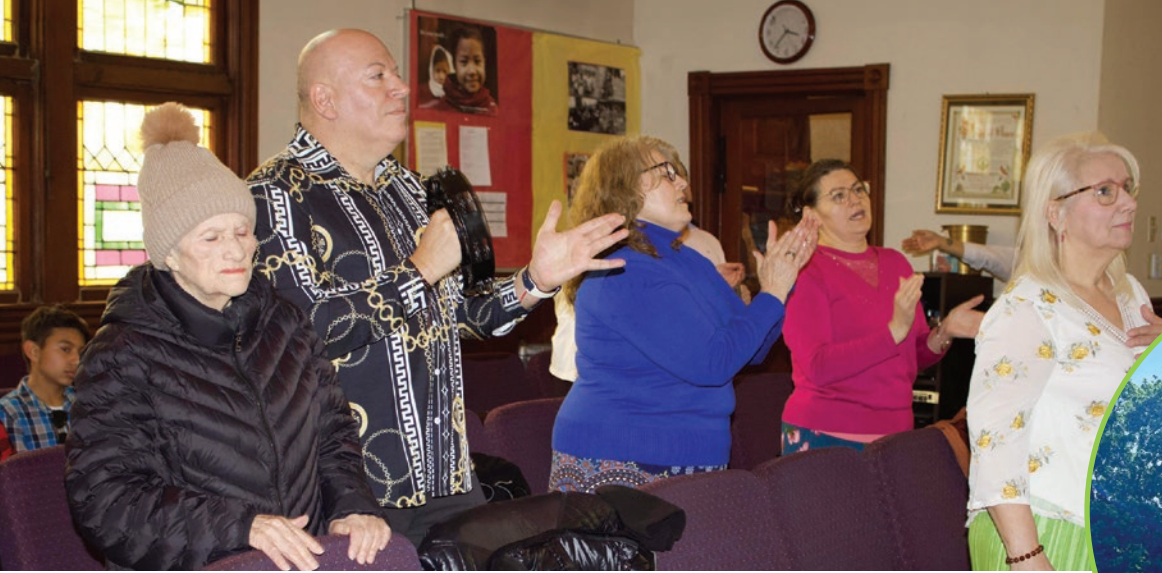
Left: People singing during a worship service.