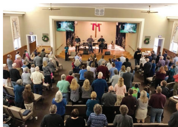
Sunday worship service at New Danville.

We are learning how to be more diverse in how we meet and interact together as we connect with people who have a hard time finding their place in a Sunday-centric church. ■