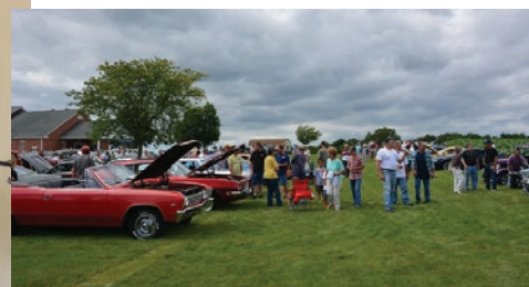
Above: Annual car show which attracts many people from the community.