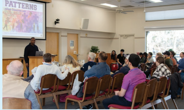
Youth Leaders Retreat, February 2025.

LMC is a Spirit-led movement, which means we need to wait for the Spirit to lead—quite possibly in new directions. Seeking the Spirit’s guidance, a small group gathered for prayer and sought direction on “next steps.” The above statements were among those used as a starting point to guide our prayer and discussion. Together, we sought to form a vision on how LMC can move forward to help support those leading the youth who may feel alone, are unsure where to turn for support, or are looking for new approaches for their youth group. Additionally, we asked what opportunities are being facilitated by LMC to help build connections between youth