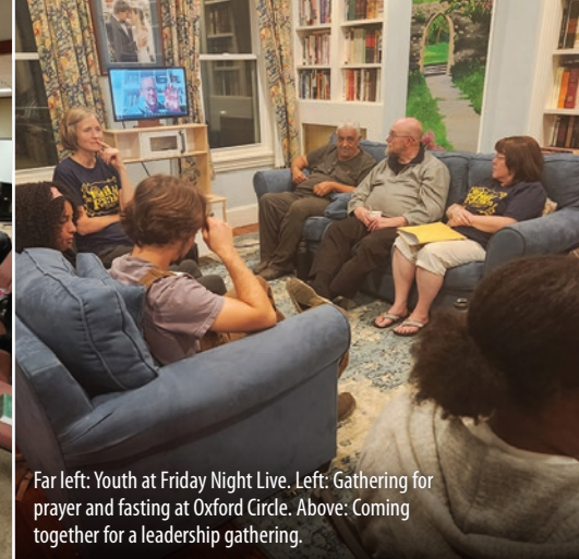
Far left: Youth at Friday Night Live. Left: Gathering for prayer and fasting at Oxford Circle. Above: Coming together for a leadership gathering.